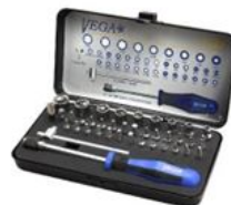
V39 39 PC INDUSTRIAL BIT, SOCKET & HAND DRIVER BIT SET