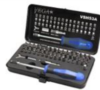
VSH53A 53 PC INDUSTRIAL BIT & HAND DRIVER SET