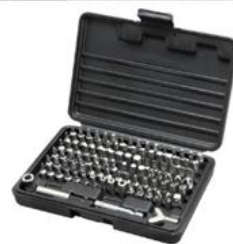
VHS100A 100 PC MASTER DRIVER BIT SET

Vega Y-Adapter is also included in the following sets: VHS100A , V39 , VSH53A