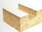
Laminates & Melamines

Cuts Clean Flat-Bottom Grooves in Materials such as: