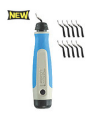
Carbide Deburring Sets 2 types available

Toll Free: 888-461-7171 Email: <u>info@eoasaw.com</u> Website: www.eoasaw.com