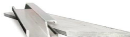
Good for cutting thick walled extrusions and profiles.