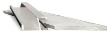
Good for cutting thick walled extrusions and profiles.