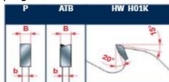
Tooth features - Caratteristiche del dente