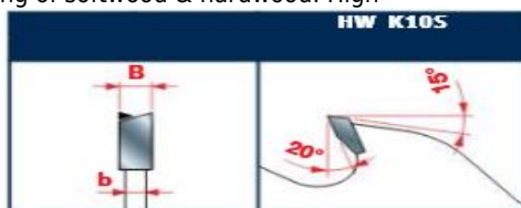
Tooth features - Caratteristiche del dente