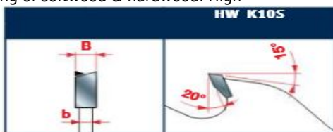
Tooth features - Caratteristiche del dente