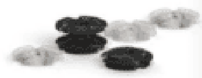
Our multi-profile head will accept any of these 14 profiles