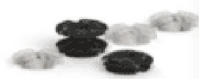
Our multi-profile head will accept any of these 14 profiles