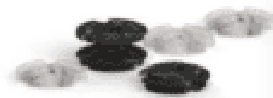
Our multi-profile head will accept any of these 14 profiles