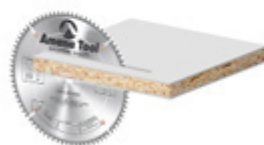
Melamine Single & Double Sided