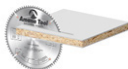
Melamine Single & Double Sided