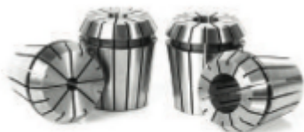
Tool No. CO-ER40 Includes 4 collets: CO-246, CO-248, CO-250, CO-254

124 South Collins Arlington, TX 76010 Phone: 817-461-7171 • Fax: 817-795-6651 Toll Free: 888-461-7171 Email: info@eoasaw.com Website: www.eoasaw.com