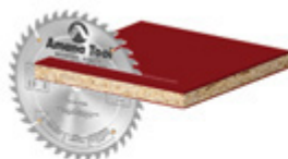
Plastic Laminate Single & Double Sided