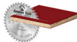
Plastic Laminate Single & Double Sided