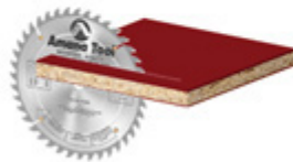
Plastic Laminate Single & Double Sided