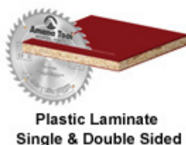
Plastic Laminate Single & Double Sided