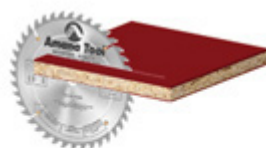
Plastic Laminate Single & Double Sided