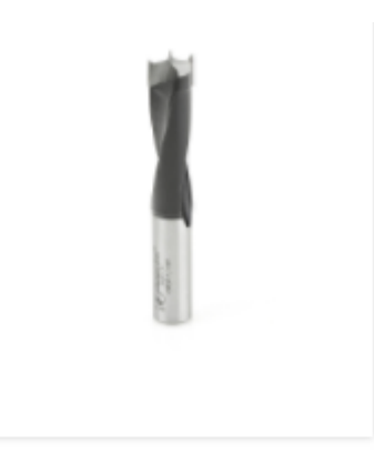
204111 Carbide Tipped Brad Point Boring Bit R/H 7/16 Dia x 70mm Long x 10mm Shank