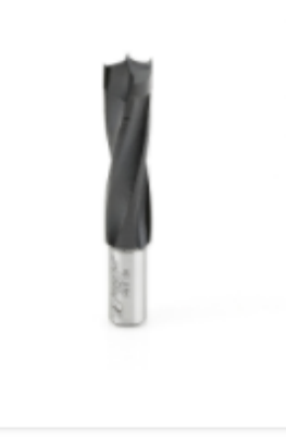
204012 Carbide Tipped Brad Point Boring Bit R/H 12mm Dia x 70mm Long x 10mm Shank