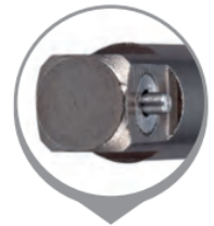
Pin lock provides extra security and safety