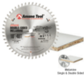
Melamine Single & Double Sided