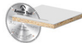
Melamine Single & Double Sided