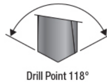
Drill Point 118°